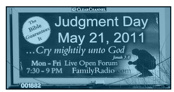
A Failed Prophecy<sup>3</sup>

The Time is at Hand (Jehovah's Witness publication)