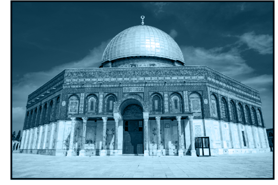
The Dome of the Rock

The temple mountain is a holy place for Jews, not only because the temple was there but because