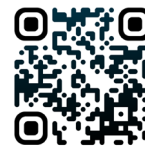
Africa Recap Video