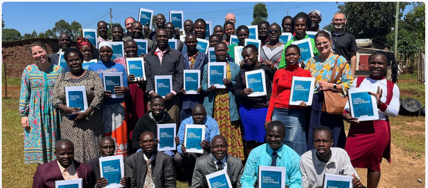
The SGC Global Training team with the leaders they trained in Kenya