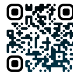
SGC Overview Video